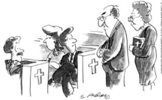
The whole church watched with nervous anticipation as the visitors sat where the Martins have sat for 42 years.