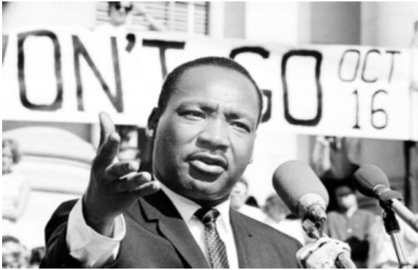
Martin Luther King Day--January 15th.

Martin Luther King, Jr. Day is the only federal holiday designated as a "day of service." talk with someone in your community who was alive during the Civil Rights era and have them provide a first-hand account of their experiences.