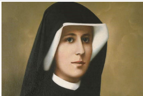
Saint Faustina: The Apostle of Divine Mercy