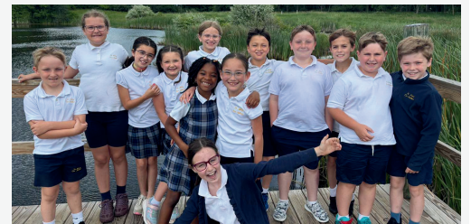
3 RD GRADE FIELD TRIP