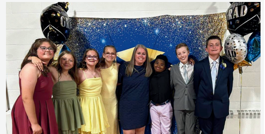
6 TH GRADE GRADUATES