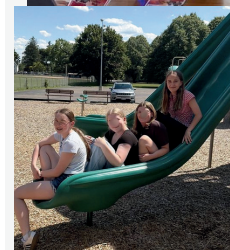
CONFIRMATION YEAR 1: SACRED HEART RETREAT