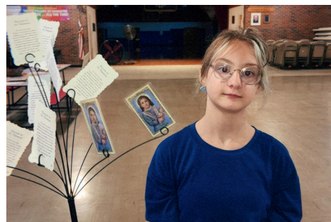
Home Study Class- Saint Project