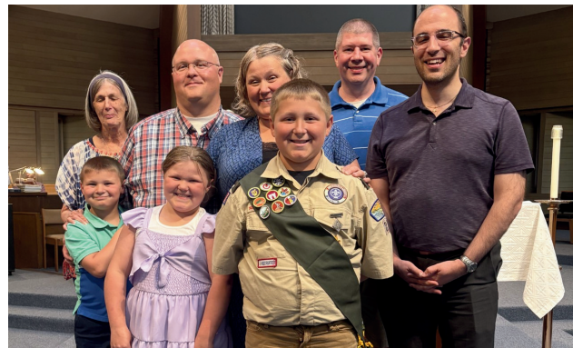
Parvuli Dei Religious Emblem Presentation