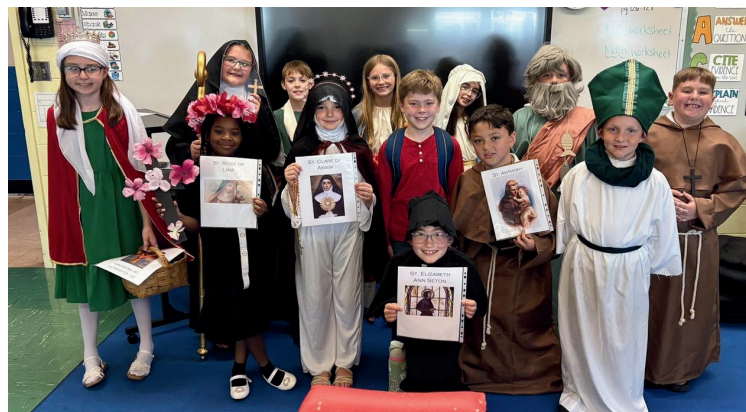
3rd Grade Students—the Saints Museum!