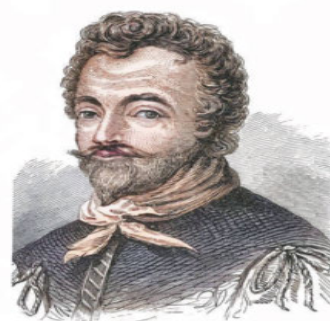
Sir Francis Drake.